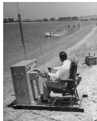
Howard Hughes flying an R/C model of his Spruce Goose