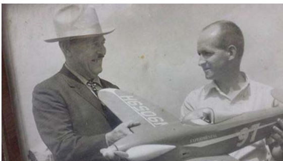
Jim with aviation legend Roscoe Turner